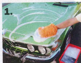
1. Wash thoroughly and rinse.

"I have a black Challenger and I use this after every wash/dry... it really makes a difference. It removes stray water spots and gives the car a great shine. At the top of my list of best car care products I've used." — Porknozzle