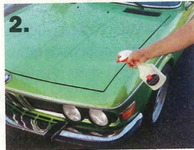
2. Spray liberally onto surface.