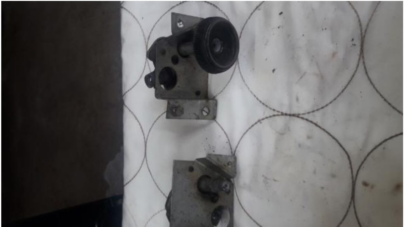
Chrome trim bits